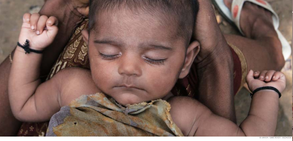
Millions of children are growing up without citizenship and access to basic rights.